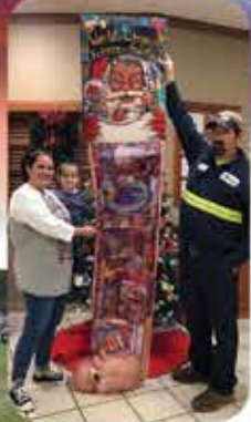
RYLEE wins big in Lufkin!