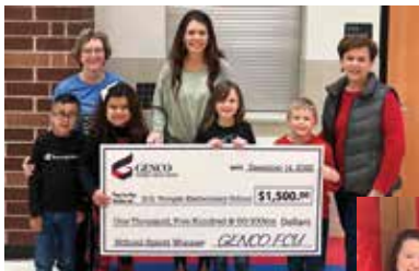
▲ H.G. TEMPLE ELEMENTARY IN LUFKIN

In fall of 2022, we had our 4th annual School Spirit Competition and asked our members to vote for their favorite school, one in each county that GENCO serves. Congrats to our 2022 School Spirit Vote Winners!