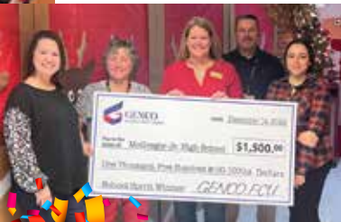
MCGREGOR JR HIGH SCHOOL IN MCLENNAN COUNTY